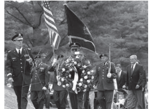
July 4, 2007 celebration of Calvin Coolidge's Birthday

Who can forget Fourth of July? The only U.S. President to be born on Independence Day, hundreds will gather at The Notch at 12 Noon on Sunday, July 4 th to walk with the Vermont National Guard Color Guard a few hundred yards to the burial place of Calvin Coolidge and numerous Coolidge family members. Traditionally, the White House sends a beautiful wreath, which will be laid on the tombstone of President Coolidge. Following at The Notch, a guest speaker will address the crowd