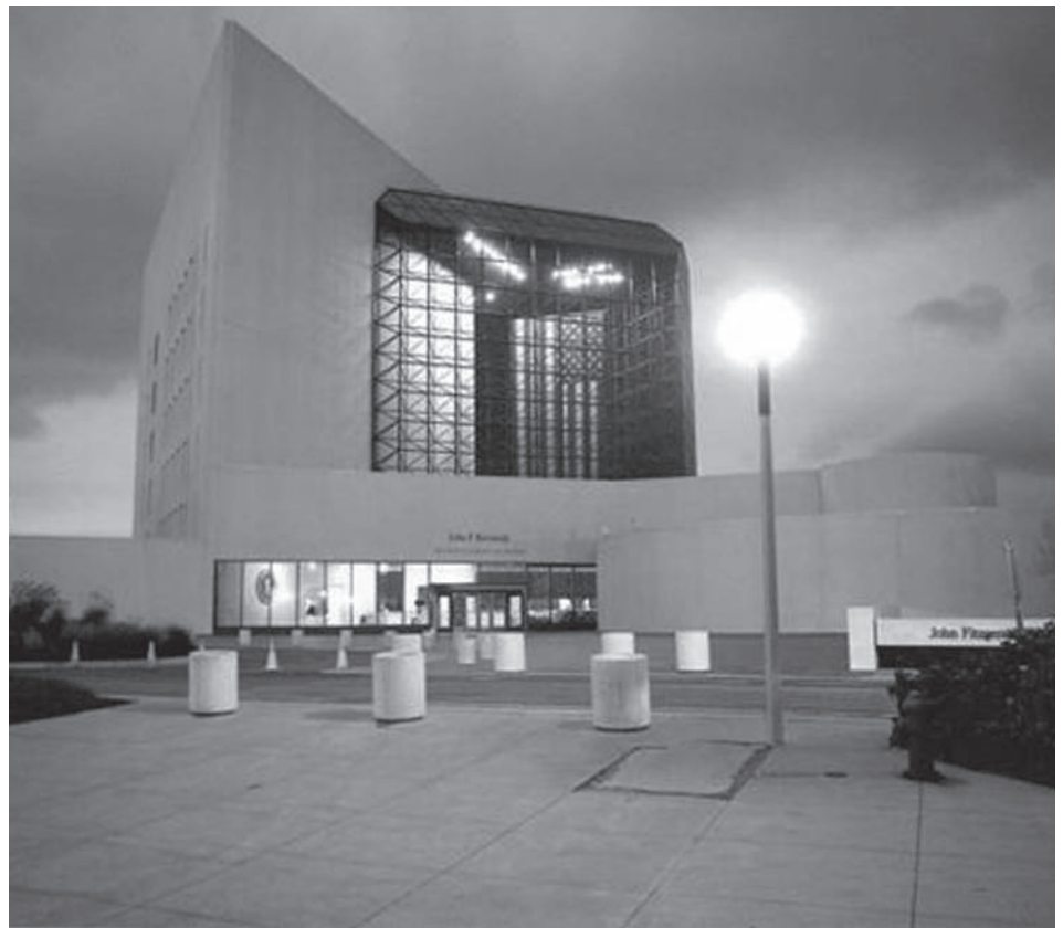
The John F. Kennedy Presidential Library and Museum

Named the biggest event in the State of Vermont in 2010 by The Vermont Standard , the official opening of the Calvin Coolidge Education Center and Museum at Plymouth Notch is scheduled for Saturday, August 7 th . This impressive construction project will be complete and it will be an exciting day to visit the Homestead that was the birthplace of Calvin Coolidge. Also known as Old Home Day, starting at 9 a.m., the Foundation's Annual Meeting will be conducted in the Union Church with keynote speakers and attendance by numerous dignitaries on hand to see the new Center. Governor Jim Douglas will be on hand for the official ribbon cutting, followed by guided tours that will take visitors through the new Center, where vaults protect the Coolidge memorabilia, the Museum displays the history of his life and times, and the beautiful new Foundation offices will be visible. Throughout the day, families will enjoy the activities at The Notch, including food and other refreshments, banners and buttons of the Coolidge presidency era, entertainment, and a