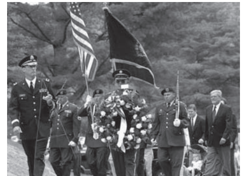
July 4, 2007 celebration of Calvin Coolidge's Birthday

Who can forget Fourth of July? The only U.S. President to be born on Independence Day, hundreds will gather at The Notch at 12 Noon on Sunday, July 4 th to walk with the Vermont National Guard Color Guard a few hundred yards to the burial place of Calvin Coolidge and numerous Coolidge family members. Traditionally, the White House sends a beautiful wreath, which will be laid on the tombstone of President Coolidge. Following at The Notch, a guest speaker will address the crowd