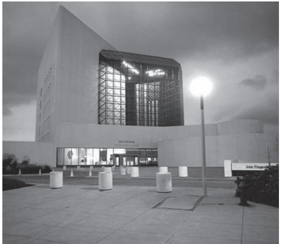
The John F. Kennedy Presidential Library and Museum

Named the biggest event in the State of Vermont in 2010 by The Vermont Standard , the official opening of the Calvin Coolidge Education Center and Museum at Plymouth Notch is scheduled for Saturday, August 7 th . This impressive construction project will be complete and it will be an exciting day to visit the Homestead that was the birthplace of Calvin Coolidge. Also known as Old Home Day, starting at 9 a.m., the Foundation's Annual Meeting will be conducted in the Union Church with keynote speakers and attendance by numerous dignitaries on hand to see the new Center. Governor Jim Douglas will be on hand for the official ribbon cutting, followed by guided tours that will take visitors through the new Center, where vaults protect the Coolidge memorabilia, the Museum displays the history of his life and times, and the beautiful new Foundation offices will be visible. Throughout the day, families will enjoy the activities at The Notch, including food and other refreshments, banners and buttons of the Coolidge presidency era, entertainment, and a