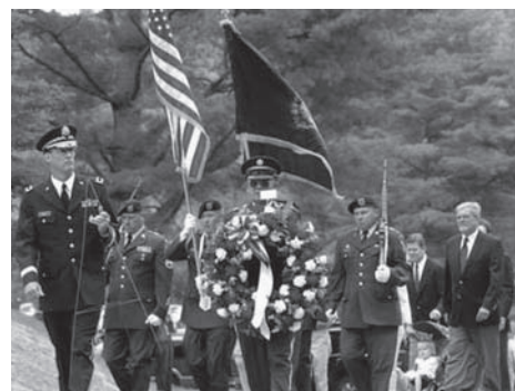
July 4, 2007 celebration of Calvin Coolidge's Birthday

Who can forget Fourth of July? The only U.S. President to be born on Independence Day, hundreds will gather at The Notch at 12 Noon on Sunday, July 4 th to walk with the Vermont National Guard Color Guard a few hundred yards to the burial place of Calvin Coolidge and numerous Coolidge family members. Traditionally, the White House sends a beautiful wreath, which will be laid on the tombstone of President Coolidge. Following at The Notch, a guest speaker will address the crowd