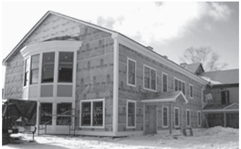
President Calvin Coolidge Museum and Education Center to be dedicated by Vermont Governor James H. Douglas on August 7, 2010.