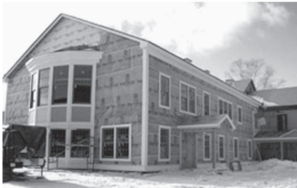
President Calvin Coolidge Museum and Education Center to be dedicated by Vermont Governor James H. Douglas on August 7, 2010.