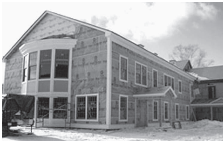
President Calvin Coolidge Museum and Education Center to be dedicated by Vermont Governor James H. Douglas on August 7, 2010.