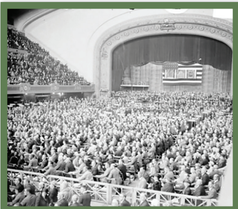
Delegates crowded in at Cleveland’s Public Auditorium during the 1924 Republican National Convention. President Calvin Coolidge was not among them, as sitting presidents did not ordinarily attend their own nominating conventions in those days.

The New York Herald Tribune headline ran, “Convention Runs as Smoothly as Machine That Makes Nails.” The reporter noted that the convention was “methodical as a machine that makes wire nails.”