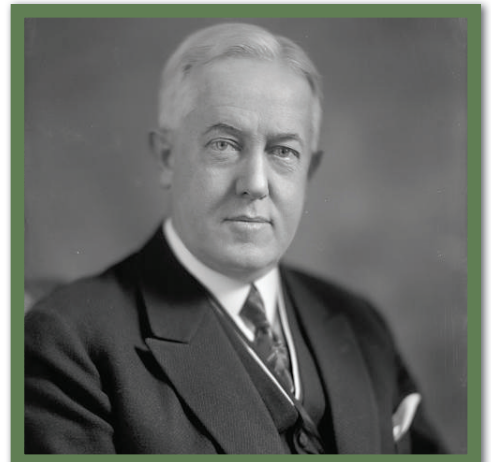
Former U.S. Ambassador to Great Britain John W. Davis, the 1924 Democratic presidential nominee (Courtesy of the Library of Congress).

This final point should be sobering to both the GOP and the Democratic Party in July 2016. Contested conventions have not usually been as bitter as the 1924 Democratic convention, but the big winner in any “messy” convention has usually been the opposing party.