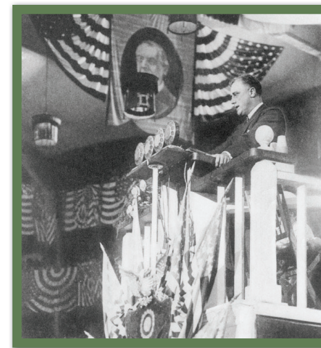
Franklin D. Roosevelt’s inspirational speech, in which Roosevelt lifted spirits and declared Gov. Al Smith America’s “Happy Warrior,” was a high point at the 1924 Democratic National Convention.