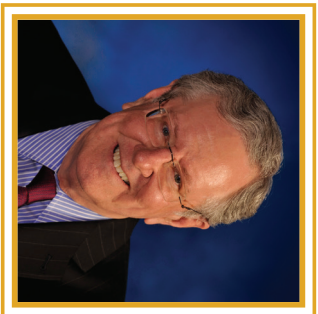
STEVE FORBES KEYNOTE SPEAKER

DECEMBER 14, 2016 3 WEST CLUB | NEW YORK CITY