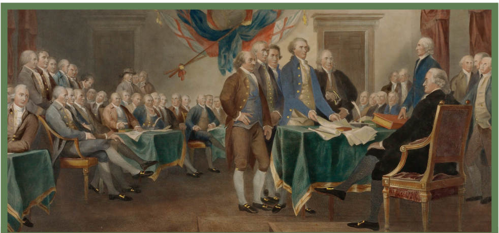
John Trumbull's famous portrait depicting the delegates responsible for the Declaration of Independence.

longest serving members of the Supreme Court sneers at the paltry “negative” rights of the Constitution. During an interview with Al Hayat TV in Egypt, Ruth Bader Ginsburg told the audience: “I would not look to the U.S. Constitution if I were drafting a constitution in the year 2012.” The justice named several she liked better, including South Africa’s, Canada’s, and the European Convention on Human Rights, praising those documents for being more generous in protecting “human rights.” Justice Ginsburg’s comments raised little concern in intellectual circles in this country because most of the enlightened elite agreed with her.