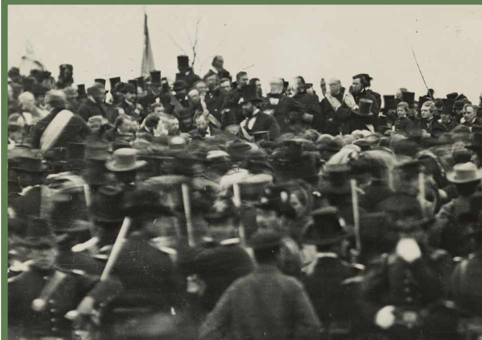
A crowd gathered at the Soldiers National Cemetery in Gettysburg, Pennsylvania listens to President Abraham Lincoln's Gettysburg Address. The president is visible in the photo, facing the crowd, not wearing his signature stove-pipe hat, in the left of the frame.

and their soundness, the only direction in which he can proceed historically is not forward, but backward toward the time when there was no equality, no rights of the individual, no rule of the people. Those who wish to proceed in that direction can not lay claim to progress. They are reactionary.”