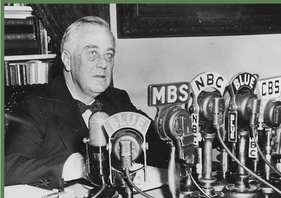
President Franklin Delano Roosevelt delivers the 1944 State of the Union Address over the radio. In this speech, Roosevelt called for a Second Bill of Rights – positive rights, such as health care and income.

Prayer to “[r]emember in pity such as are this day destitute, homeless, or forgotten of their fellow-men,” and finally morphing it from a “general personality” into a proxy for the specific groups of voters that would win Roosevelt reelection. 15 This redefinition of the Forgotten Man and the government’s responsibility toward him was the end of limited government and the beginning of a new tradition. Whereas the American Revolution was a taxpayer revolt that emphasized individual liberty and protection of private property, the Roosevelt revolution cultivated dependent constituencies and class warfare. The fruit of the former was free men and free markets; of the latter — the forgotten taxpayer and the indentured servitude of future generations.